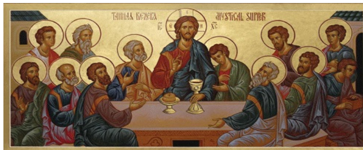
"If we really understood the Mass, we would die of joy." – St John Vianney

Please pass this Communiqué on to group members.