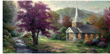
Streams of Living Water (detail) – Thomas Kinkadee

Please pass this Communiqué on to group members.